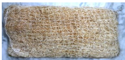
Grass Mulch Sand Filter Design